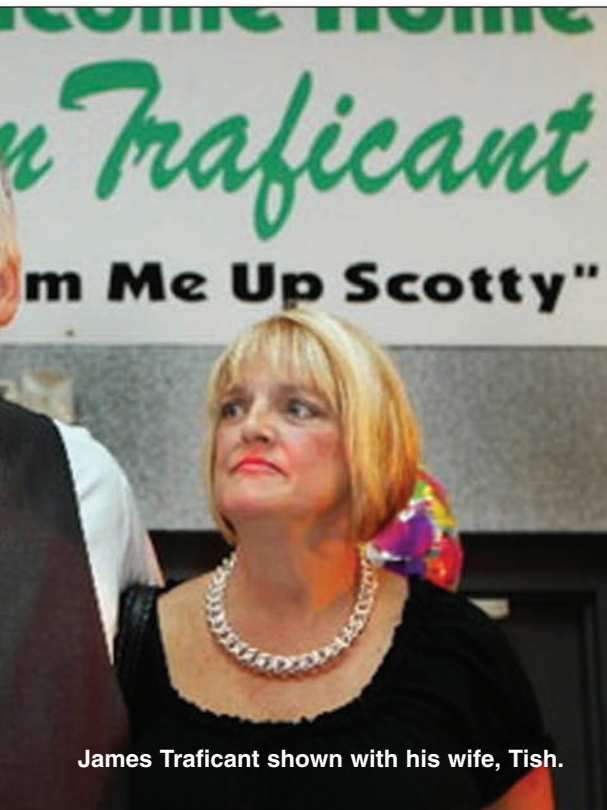
James Traficant shown with his wife, Tish.

J im Traficant is unlike any other politician in this country today. Traficant actually talks about the U.S. Constitution and what it means and why (and how) it's being ignored. He says that the tax system needs to be overhauled, that the IRS needs to be (and can be) eliminated and that a new tax system can supply all the revenue America needs to function without raping the taxpayers every April 15.